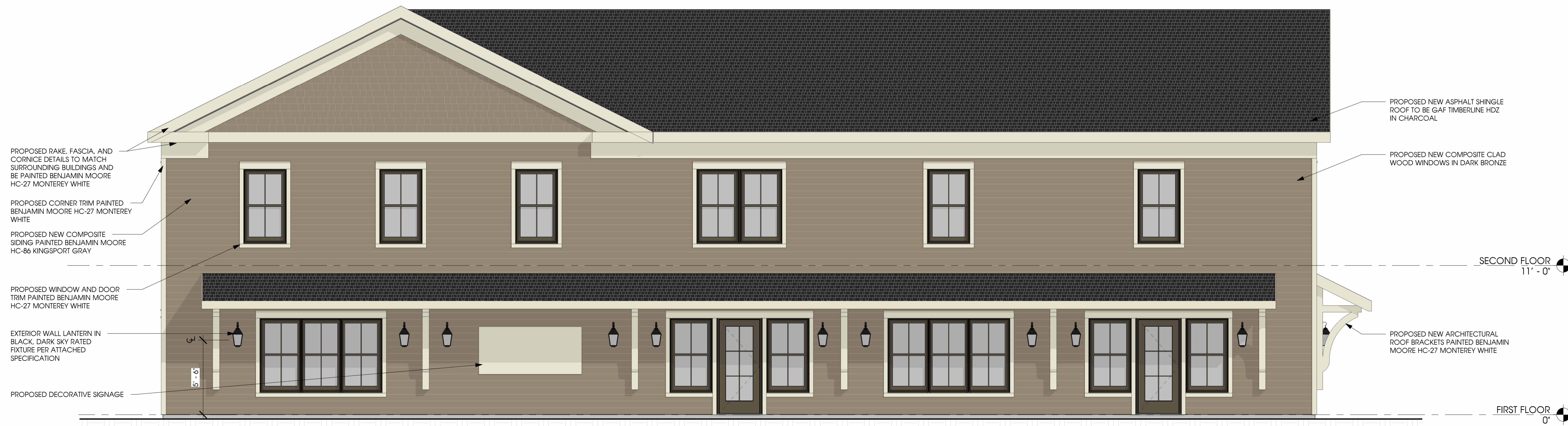
2 PROPOSED SOUTH ELEVATION - FACING RT 52 1/4" = 1'-0"

ARCHITECTURE MASTER PLANNING INTERIOR DESIGN