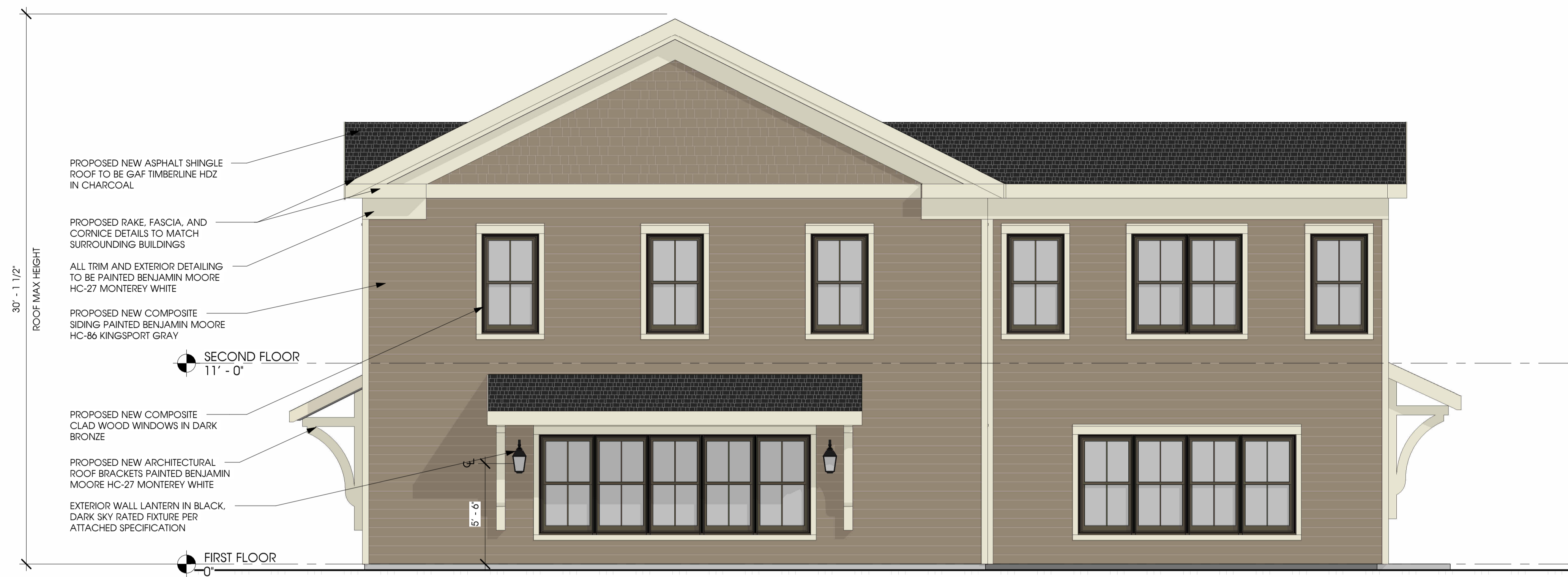
1 PROPOSED EAST ELEVATION - FACING PARKING LOT 1/4" = 1'-0"